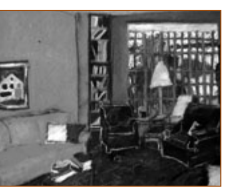
The Red Room/dry pastel on paper