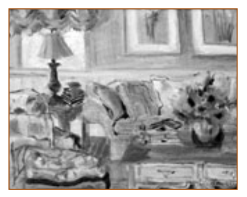
Yellow Living Room/oil on canvas