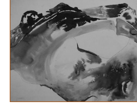
Bone Series/ink on paper