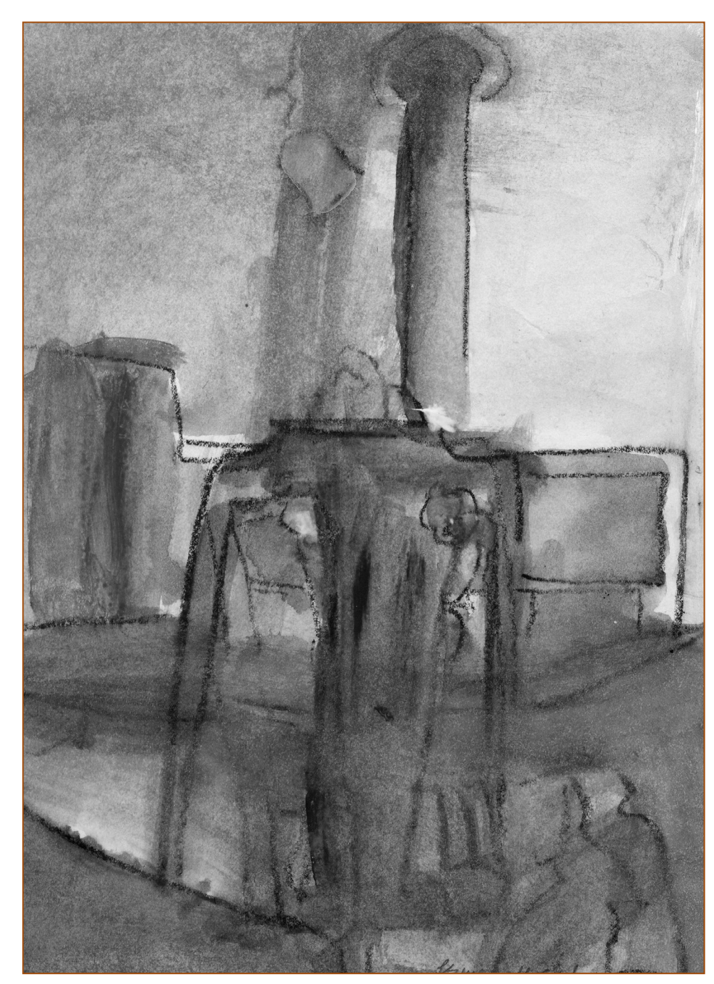
My Grandmother's Dining Room/watercolor